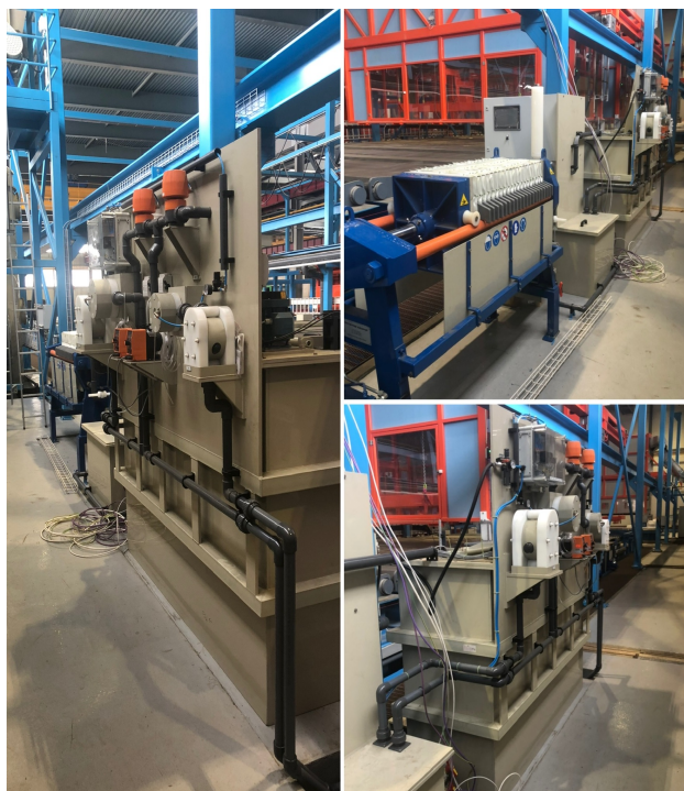
The Recyclean FRE system for flux generation is an important element in the total Recyclean system for hot dip galvanizing.

Constant iron content under 1 g/l < 1 gFe/l.